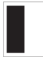
HALF PAGE vertical 95 x 254 mm