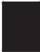
FULL PAGE trim size 230 x 300 mm full bleed 238 x 308 mm